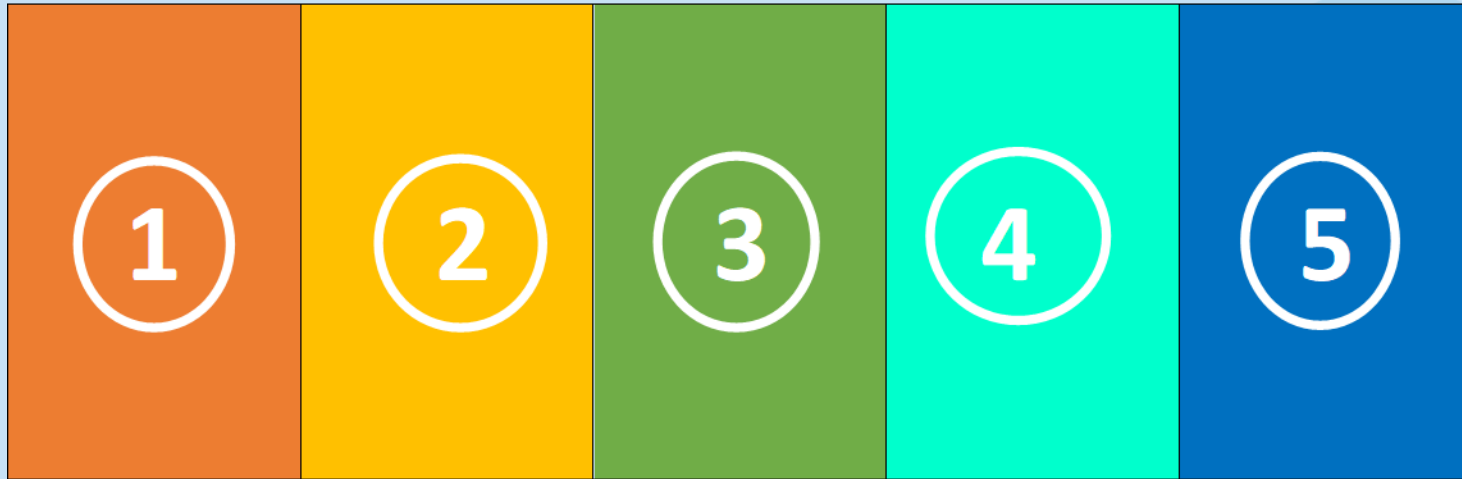
Table 1. Performance Levels